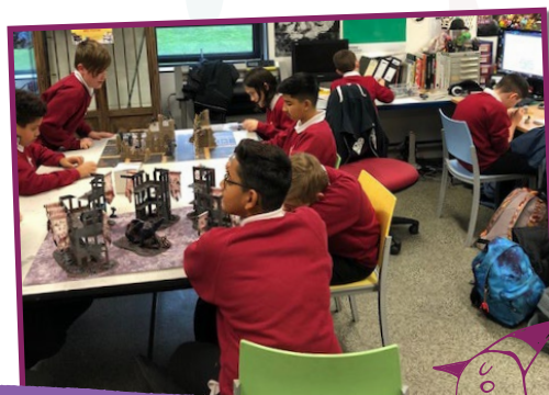
The new Warhammer Club in action!

At Netherhall Learning Campus we have an extensive range of extra-curricular activities that run for all year groups throughout the school day and over the week. All extra-curricular activities are open to all students; they simply need to go to the club that takes their interest!