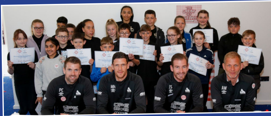
Kim Leadbeater, Ambassador of the Jo Cox Foundation commented: